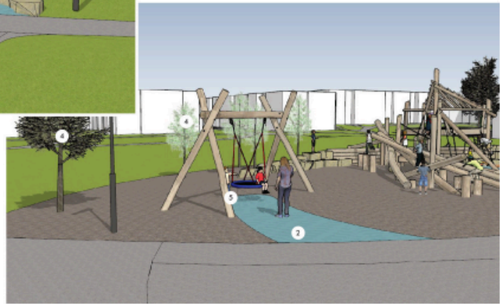
Additional Plans for Playground Structure to be installed in Fall 2024.